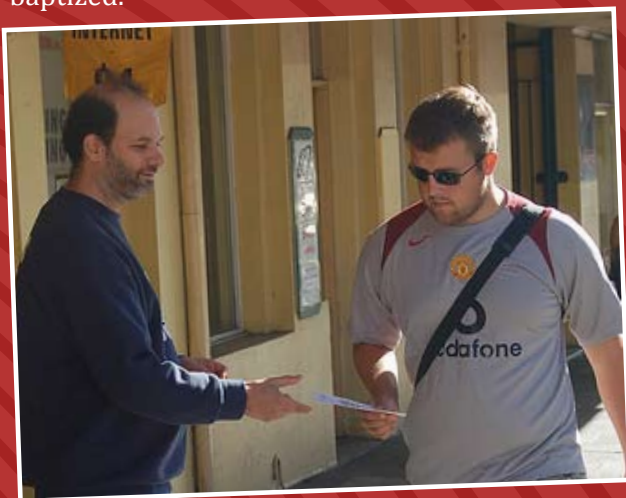
Names of many people we meet are changed to protect privacy.