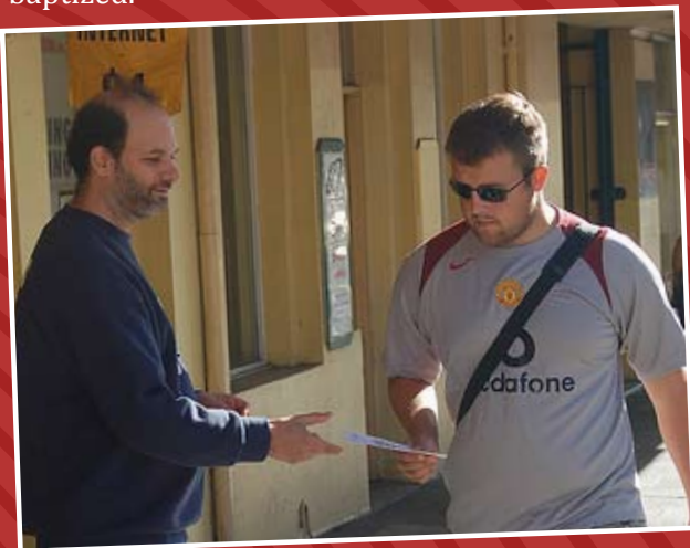
Names of many people we meet are changed to protect privacy.