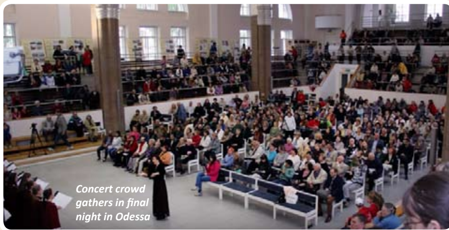
Concert crowd gathers in final night in Odessa

them to do so. But then the final concert on the last night brought out remarkable results. Over 1200 people attended. 40% were Jewish. One third raised their hands to get saved at the invitation. What? Yes, that's what we said—professing faith in Yeshua and starting new life in Him. The followup continues. The work goes on.